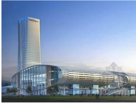
China Import and Export Fair Complex