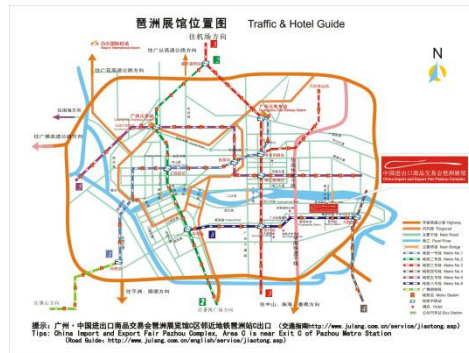
Guangzhou traffic map